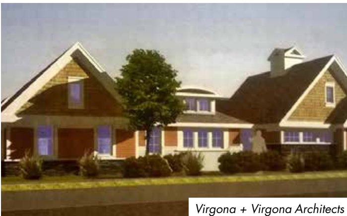
Virgona + Virgona Architects