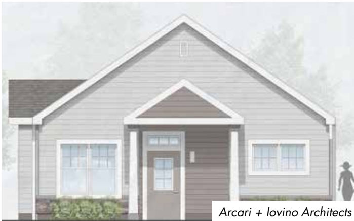
Arcari + Iovino Architects