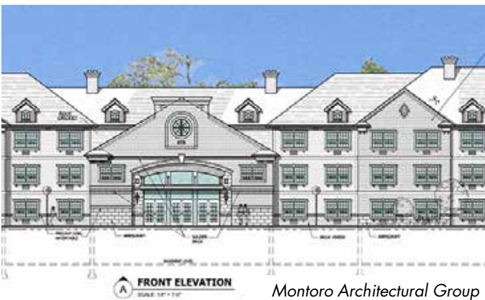
FRONT ELEVATION SCALE: 1/8" = 1'-0"