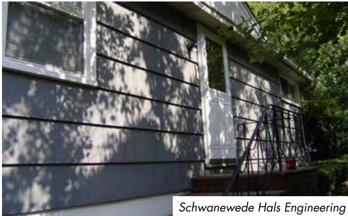
Schwanewede Hals Engineering

BOGOTA • 215 Ridgely Avenue • Owner/Service Provider: Alliance Against Homelessness