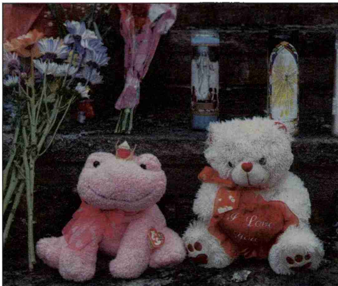
Flowers, candles, stuffed toys and balloons were placed on the front steps where a 5-year-old girl and her grandmother died after a fire quickly spread through their multi-family house.