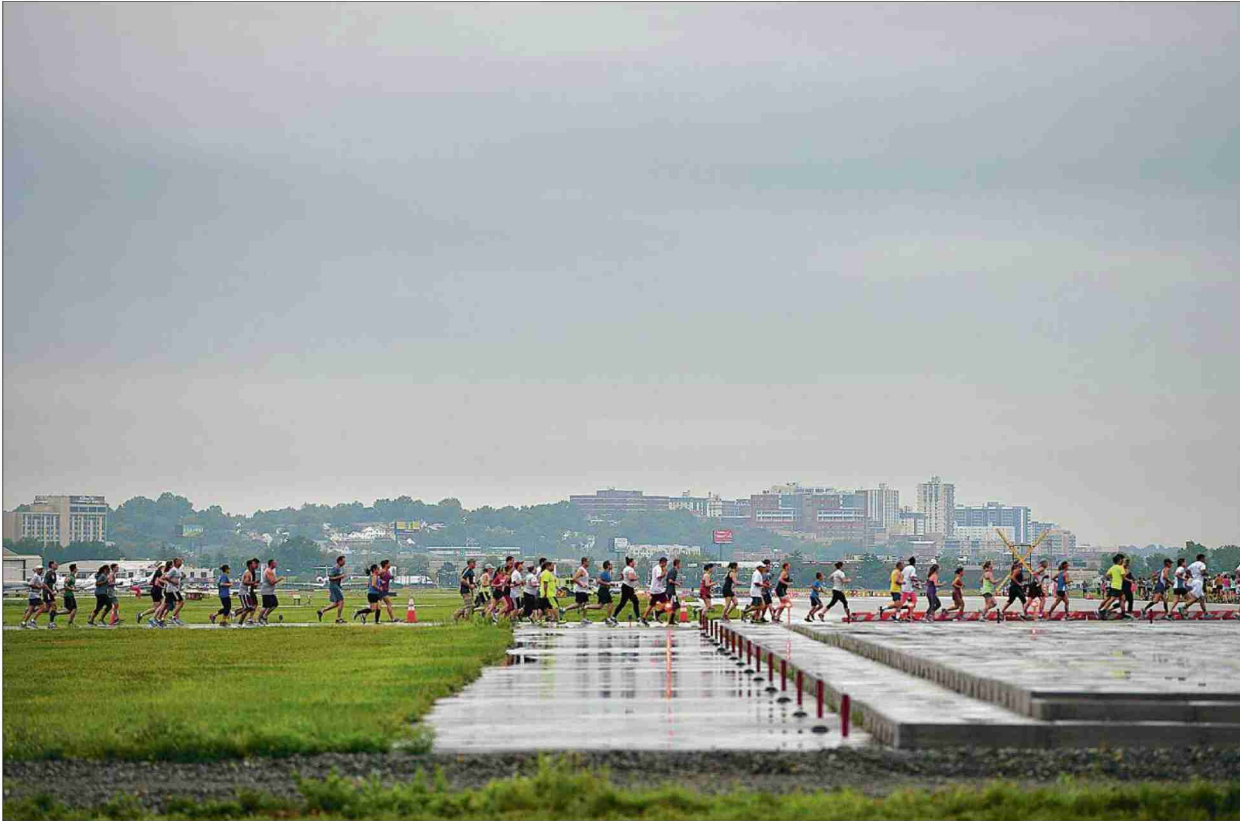
Above, runners making their way around the tarmac in Saturday's 18th annual PSE&G Teterboro Airport 5K.