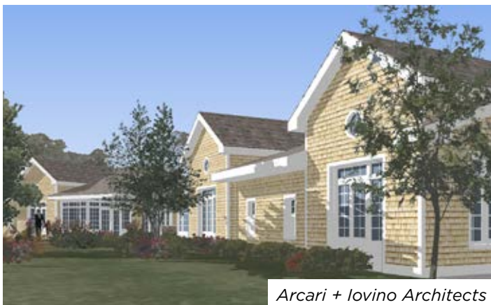
Arcari + Iovino Architects