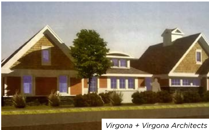
Virgona + Virgona Architects