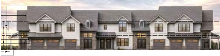
front elevation [1/8" = 1'-0"]