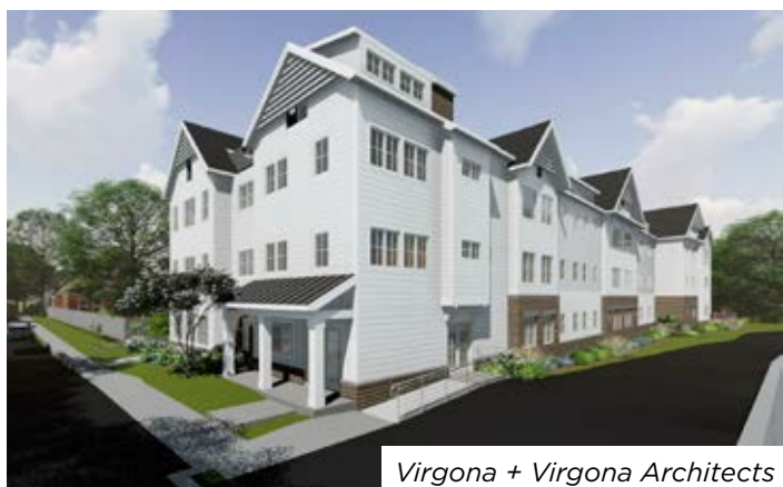
Virgona + Virgona Architects