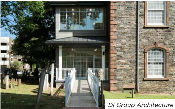
DI Group Architecture