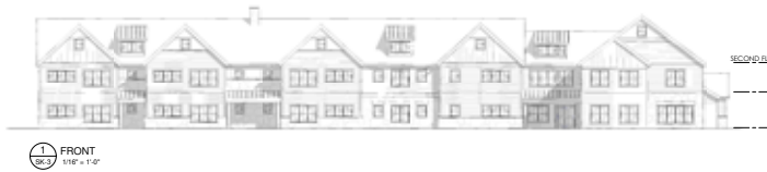
FRONT 1/8" = 1'-0"